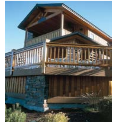
Enclose under decks so firebrands do not fly under and collect.