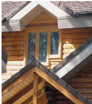
Enclose eaves and soffits.