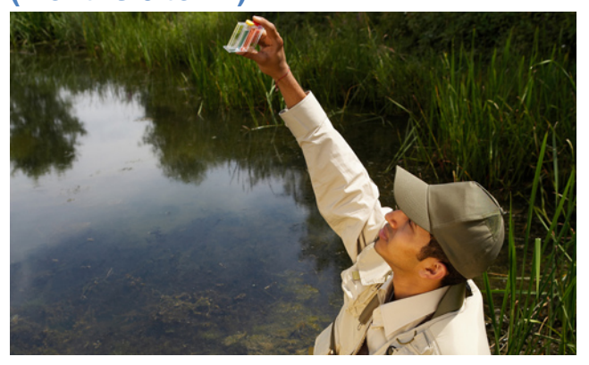
Step 2: Characterize Water Resources, Water Quality, and Basin Conditions (Months 6 to 12)

Supply Analysis: Existing data will be collected to document surface water flows, ecological conditions, and groundwater/aquifer availability on a weekly basis. The team will work closely with the Oregon