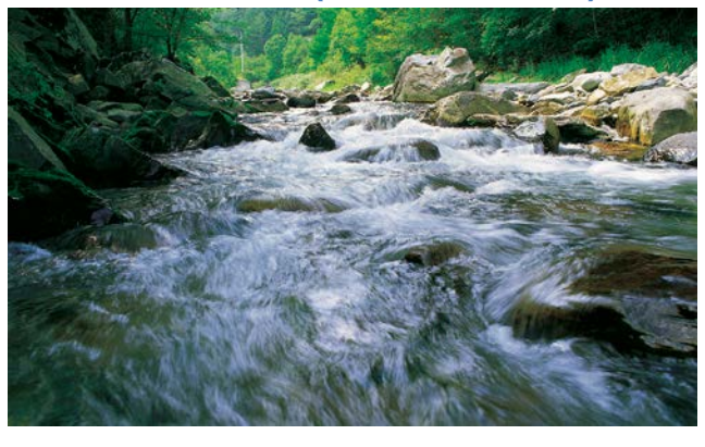
Step 3: Quantify Existing and Future Needs/Demands (Months 9 to 15)

Demand Analysis: Information will be gathered from each partner to determine current water needs by season and volume.