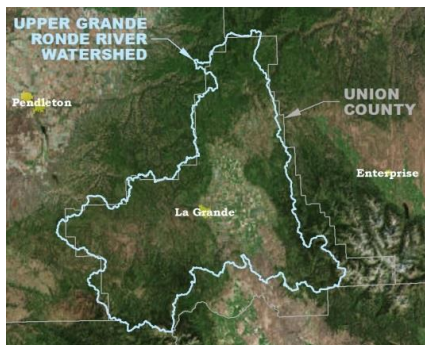
Figure 1 - Location Map

The scope of the Partnership planning will include the entire Watershed, also known as the Upper Grande Ronde River Subbasin (HUC 17060104) (which approximately matches the boundary of Union County), see Figure 1 . The Watershed encompasses nearly 1,640 square miles in northeastern Oregon. To facilitate the scoping of this project, Appendix A, Memorandum of Understanding (MOU), describes the roles and responsibilities of Partners, Appendix B, contains a list of e List of Current Partners, and Appendix C includes Exhibit A - Budget and Exhibit B - Statement of Work for Planning, Step 1 from the OWRD Grant Agreement. This document Agreement -describes