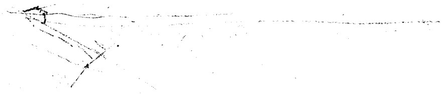
Fig. 1. Mechanical part, view 1.