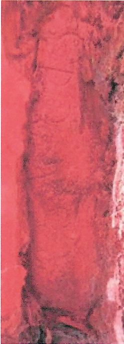
The SW 1982 BT: