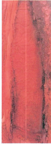
The SE 1982 BT: