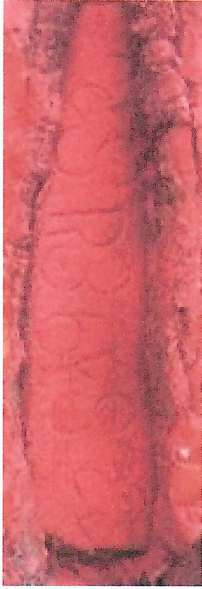
The SE (Record: NE) 1982 BT: