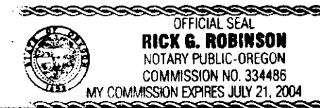
Notary Public for the State of Oregon